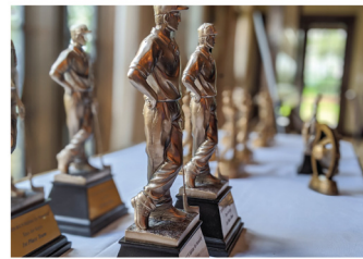
Tees for Keys Coming Fall 2023

Contact Carl Orozco for more information at corozco@habitatbcs.org