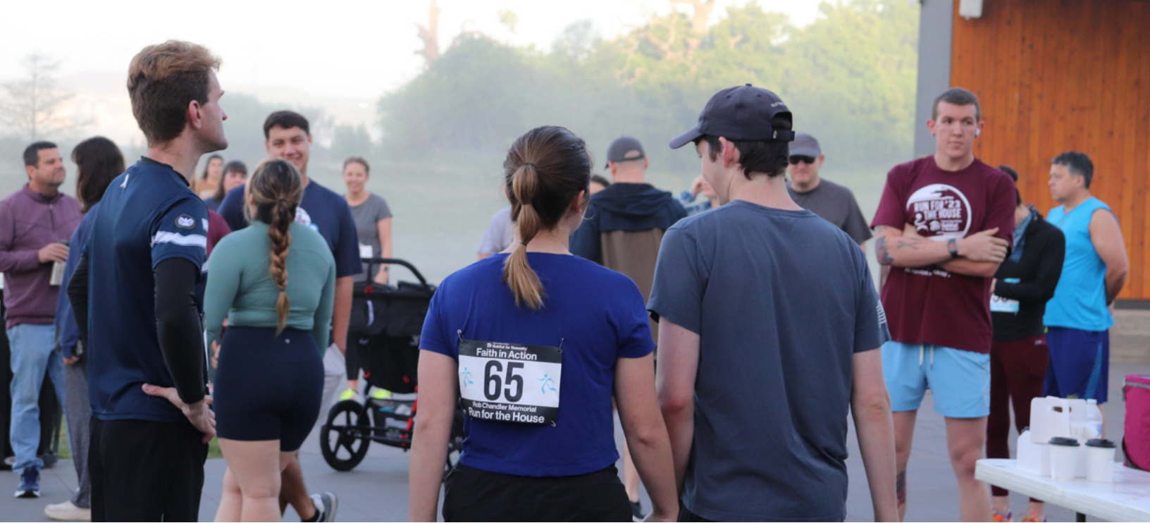
Runners and walkers awaiting the start of the race