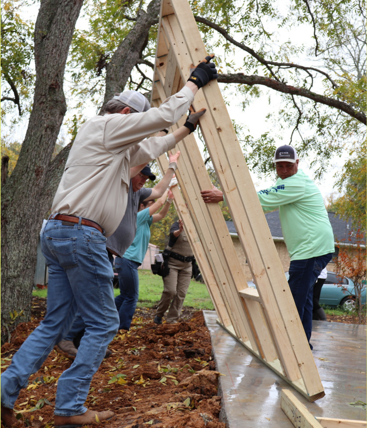
Raising the walls of the Ragston home in Brenham on Dec. 3, 2022