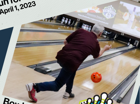
Bowl to Build DATE TBD