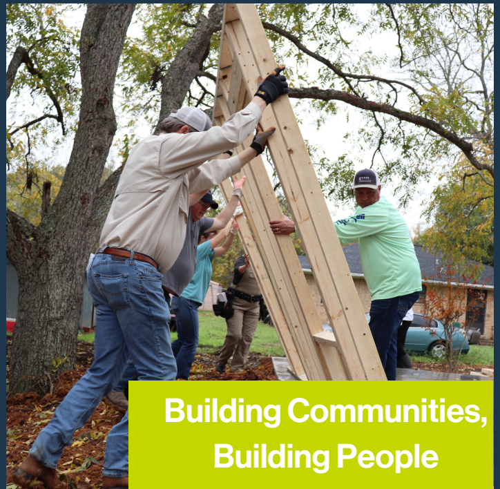
Building Communities, Building People

"I couldn't believe that kind of love existed, where people would come together to help us build a home we could actually afford. I encourage you to get involved in our community and find these families who are in impossible living situations like we were. They often don't know there's another way, but you can change that. Thank you!"