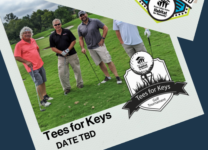
Tees for Keys DATE TBD

To learn more about our events and how you can get involved, go to https://habitatbcs.org/ today!