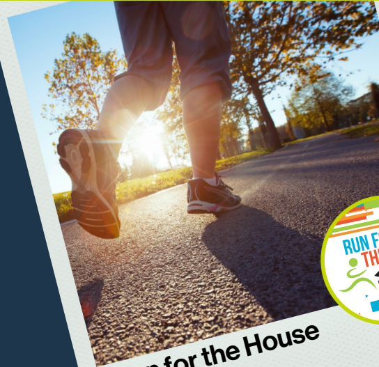
Run for the House April 1, 2023